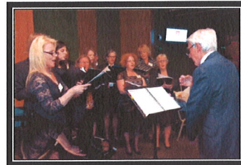
Performance by the Bar Choir